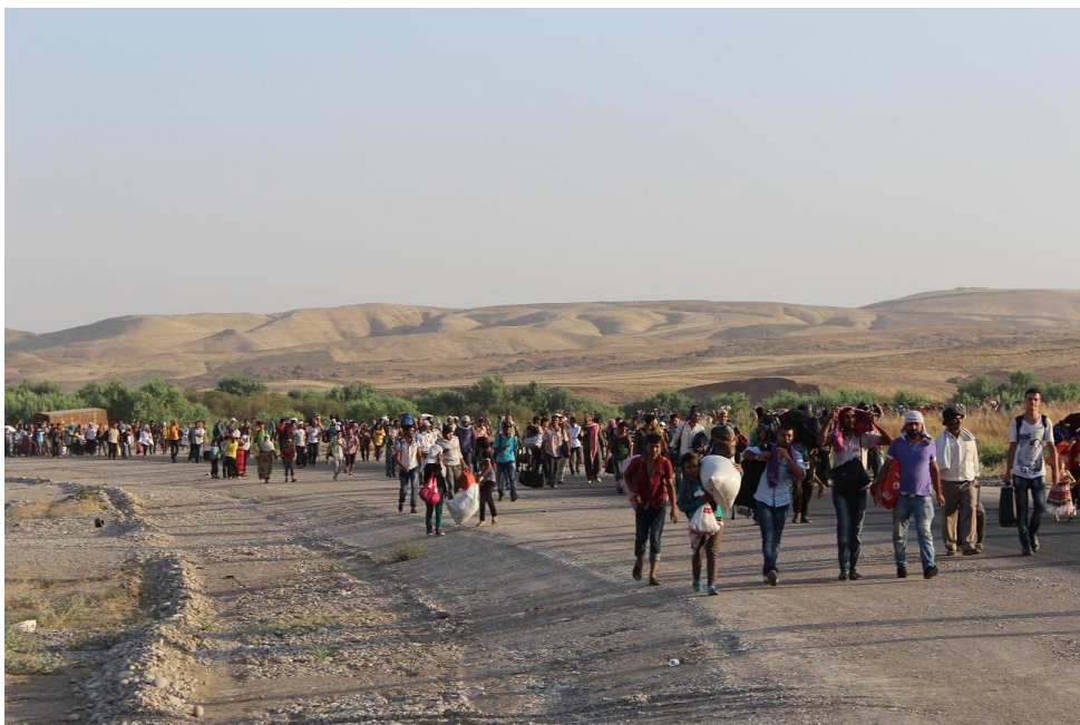
More than 50,000 Syria refugees have fled to the Kurdistan Region of northern Iraq since mid-August.