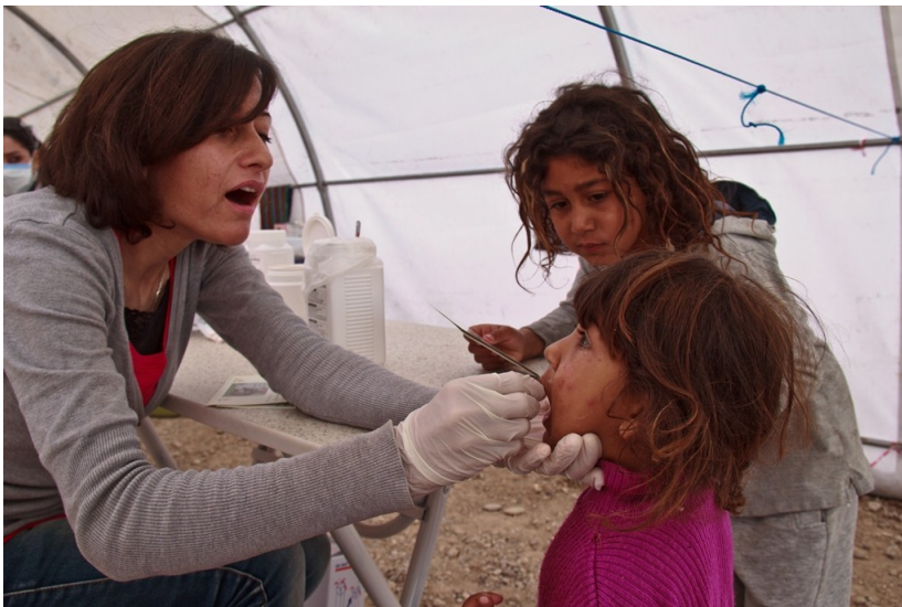
A young Syrian refugee receives a Vitamin A supplement during a UNICEF-supported measles and meningitis vaccination drive at Domiz camp in northern Iraq.

The regional response for refugees fleeing Syria is the coordinated effort of 126 participating organizations, including 84 appealing: