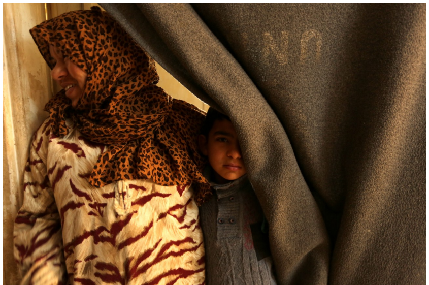
Around 200 Palestinian refugees from Syria are living in Cyber City, Jordan.